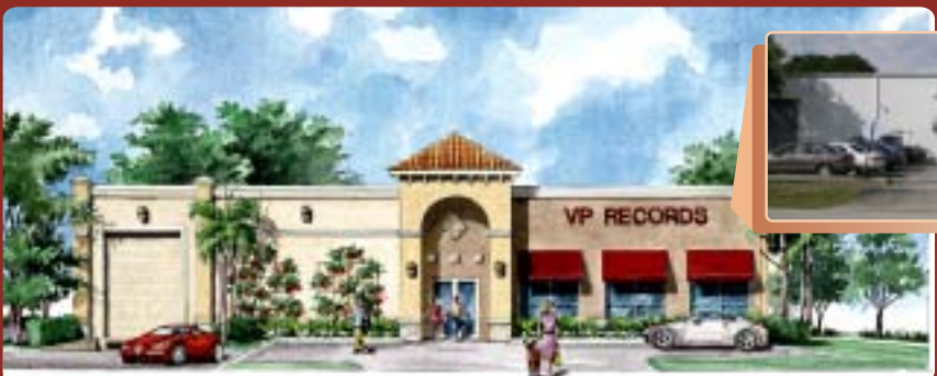
9 VP Records