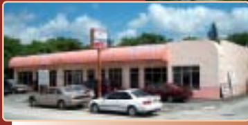
2 Exotica Beauty Academy