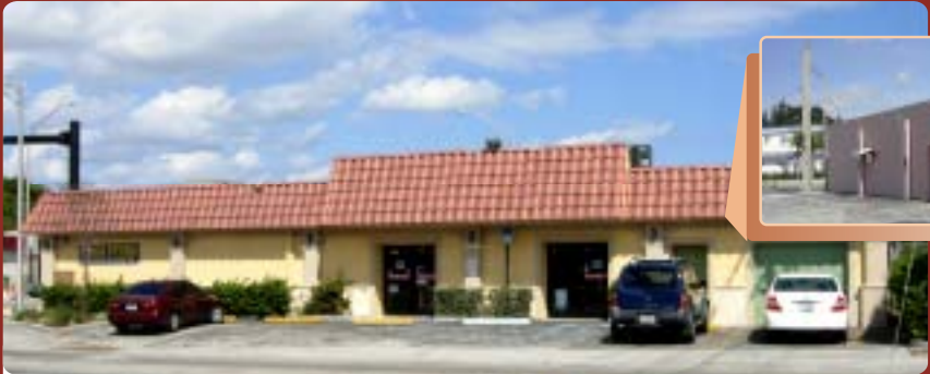
1 Thelwell Retail Property