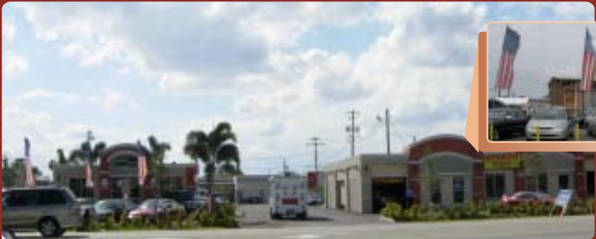
5 Nepola Retail Property