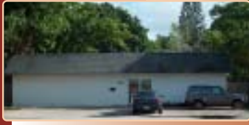
4 Sunshine Realty & Brokerage