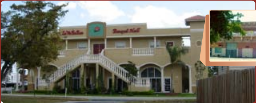
3 La vie en rose Banquet Hall