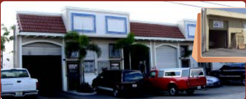
7 Liguori Warehouse