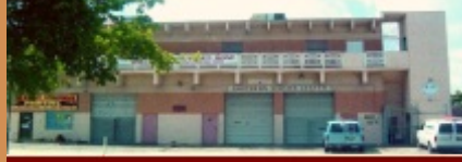
6040 SW 21st Street; 6,060 square foot banquet hall on 0.53 - acre site