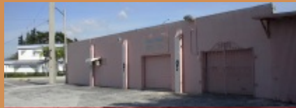
6152 Pembroke Road; 2,863 square foot retail space on 0.13 - acre site

The East Miramar Commercial Redevelopment Program is one of the key implementation strategies developed in conjunction with the East Miramar Neighborhood Vision Plan, a program that is intended to promote the revitalization of this traditional neighborhood area. The program is designed to complement the City's aggressive and concentrated neighborhood improvement focus in this area. This focus includes extensive infrastructure enhancements, housing rehabilitation initiatives, parks and open space improvements, tailored zoning and land use regulations and transportation system enhancements.