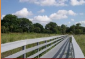
Snake Warrior Island Park