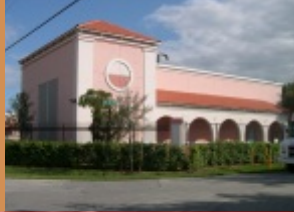
East Water Treatment Plant Renovation