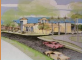
Regional Multi-Service Complex