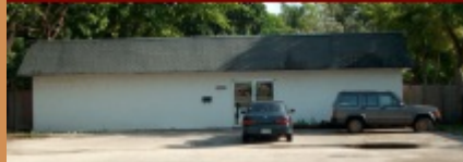
6237 Miramar Parkway; 1,812 square foot office on 0.31 - acre site