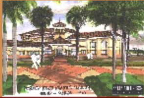
Shirley Branca Park PAL Facility