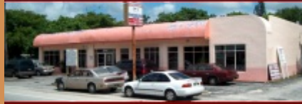
6229 Miramar Parkway; 5,000 square foot beauty school on 0.51 - acre site